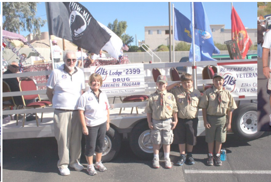
Lodge sponsored scouts and Jr. golfers. Lodge Drug Awareness display.