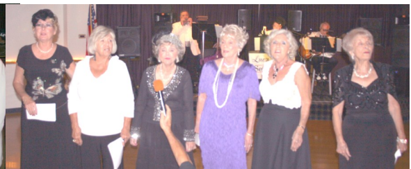
The Andrews Sisters Editors note. This was the music we WWII vets danced to during our high school proms!